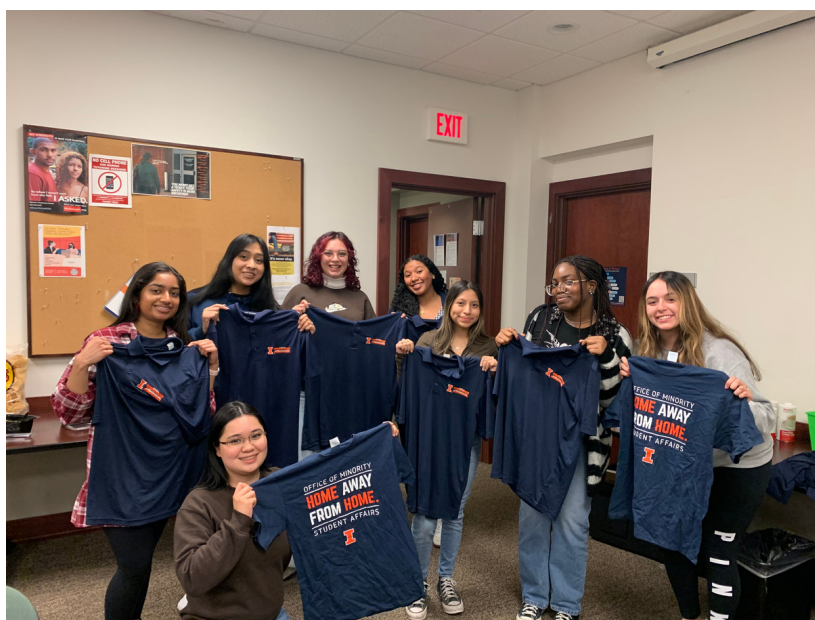
Photo from the Spring 2023 OMSA Ambassadors retreat

OMSA Ambassadors are established and burgeoning campus leaders that uphold OMSA's mission to provide exceptional support services to first generation, low income, and historically underrepresented students at Illinois. In doing so, the OMSA Ambassadors learn to exemplify the four tenets of student excellence: Achievement, Leadership, Professionalism, Service.