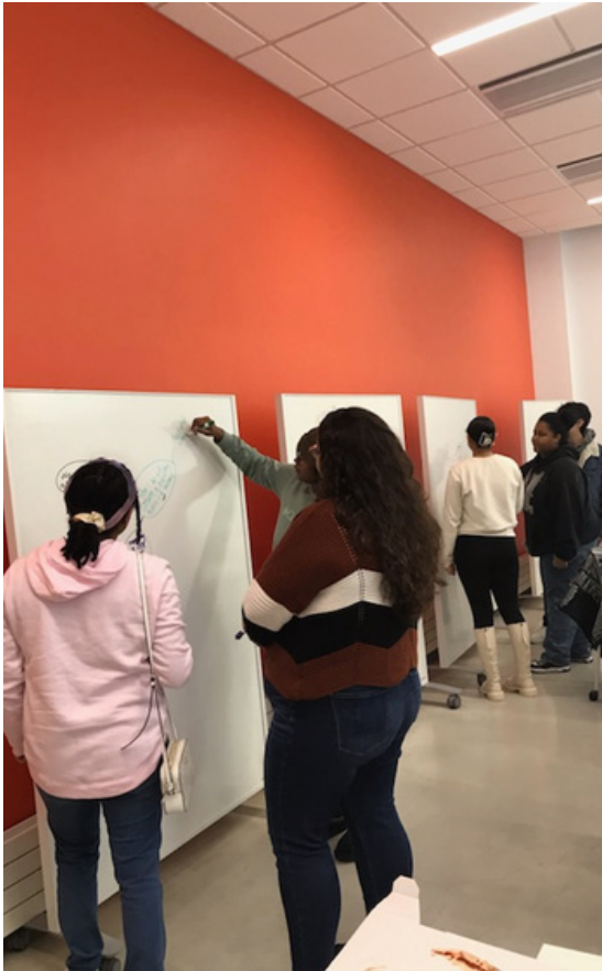
SSS students engaged in a creating confidence interactive activity at the Siebel Center.